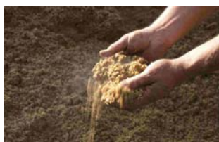
Photo: Hand pouring grain (high res image available from mediareleases@monkscom.com.au )

farmers take greater for money and reduce