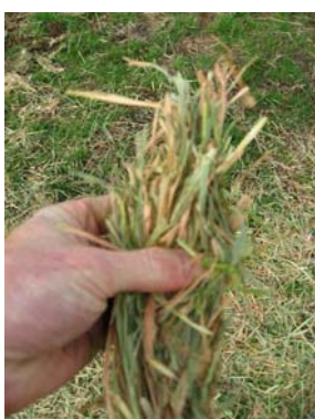
Photo: Hand holding hay

Caption: Feed buying workshops will help dairy control over their feed purchasing to get better value risk.